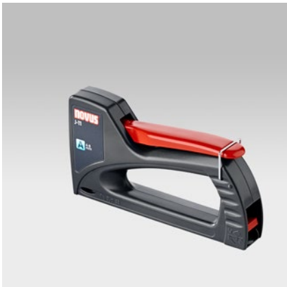
The tacker handle can be locked down when not in use or for storage.