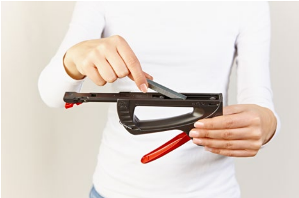
Integrated staple slider for quick loading of staples. All parts form a single unit with no loose parts to lose.