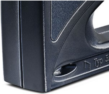
The open staple channel shows how many staples are left in the magazine.